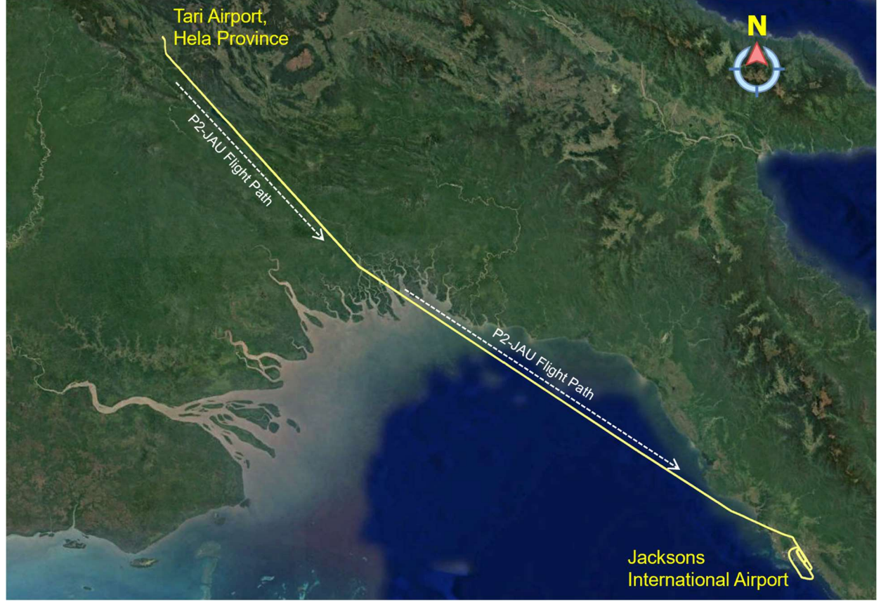
Figure 1:P2-JAU depiction of occurrence Flight path from Tari Airport to Jacksons International Airport

On 1 September 2023, at 12:51 local (02:51 UTC<sup>1</sup>), a Beechcraft B200C Super King Air aircraft, registered P2-JAU, owned and operated by Tropicair Limited, operating a non-scheduled passenger charter flight from Tari Airport, Hela Province to Jacksons International Airport, National Capital District, sustained a landing gear assembly collapse during the landing roll at Jacksons runway 14R.