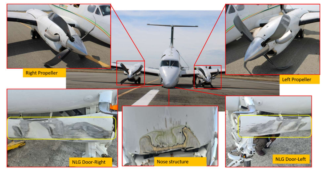
Figure 3: P2-JAU observed damage at occurrence site

It was reported that a precautionary disembarkation was carried out. The flight crew with the assistance of ARFF assisted the passengers to exit and move away from the aircraft.