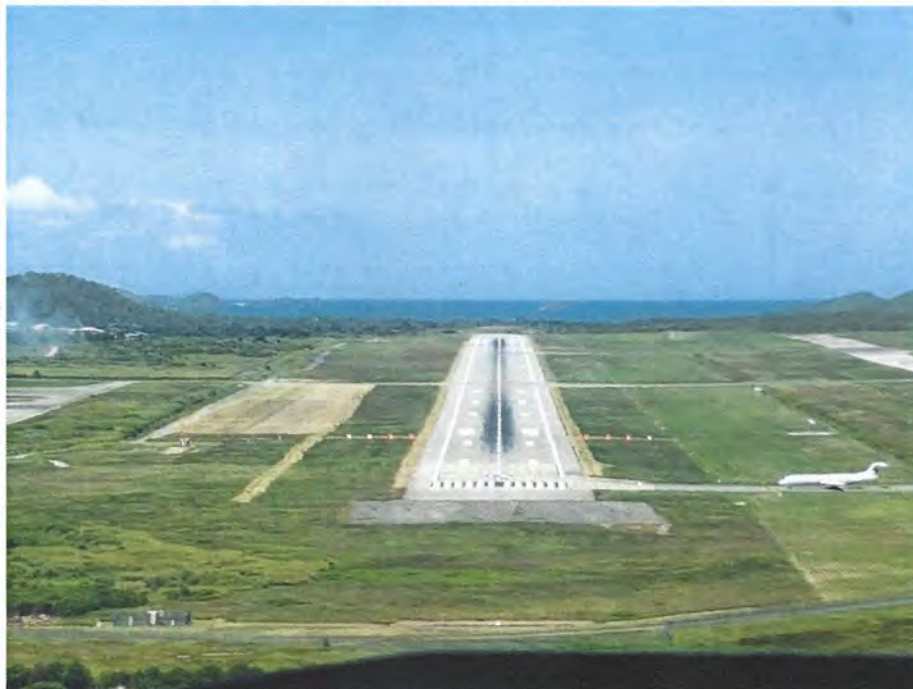
Figure 1: Jacksons International Airport Runway 14L showing PAPIs

The approach was being conducted in visual meteorological conditions.